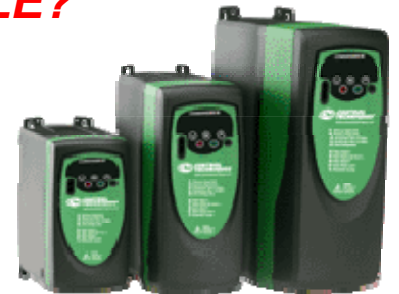
Commander SK family

For some larger model CDEs the SM-I/O Lite module may be required. Consult technical support for further details.