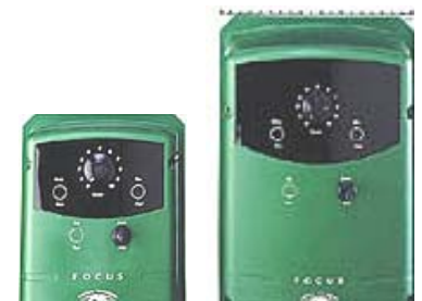
2HP Focus Enclosed

Complex applications may require review of your original system drawings