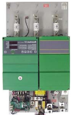
Click on photos for details