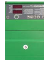
Click on photos for details