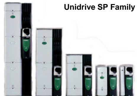
Unidrive SP Family