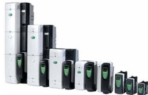
Commander SK Family

Email us by clicking -> Technical Support__